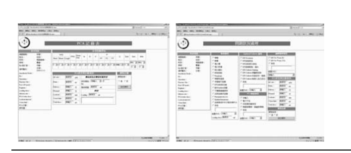
Fig. 2. The web form of daily visitation and problem response chart.

Discussion: The web-based PCA EDC system is still testing and not yet officially online. According to the steps in the website development process, the function usability of user interface needs to be evaluated over and over again, especially in medical environment. web-based PCA